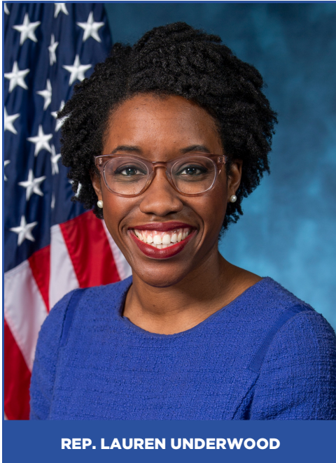
REP. LAUREN UNDERWOOD